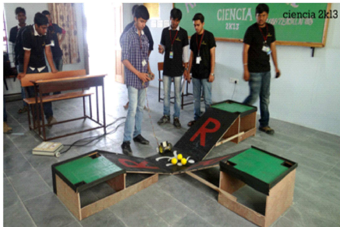
Exhibits at Ciencia

All that we are is the result of what we have thought. The mind is everything.