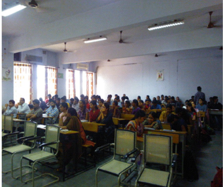
The workshop in full swing