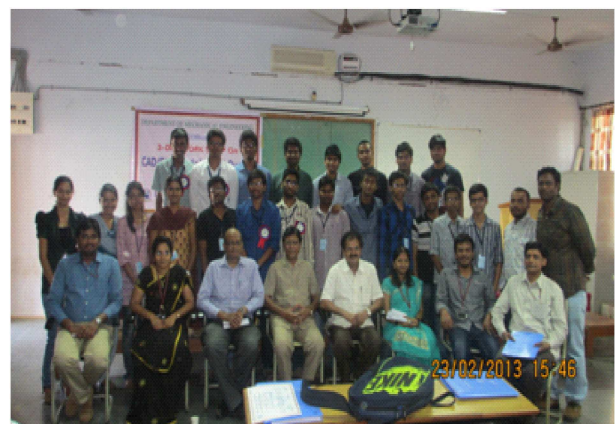
Successful Completion of Workshop

With the new day comes new strength and new thoughts. Eleanor Roosevelt