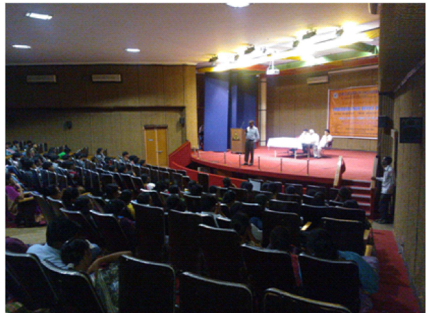
Rapt Audience at the Workshop