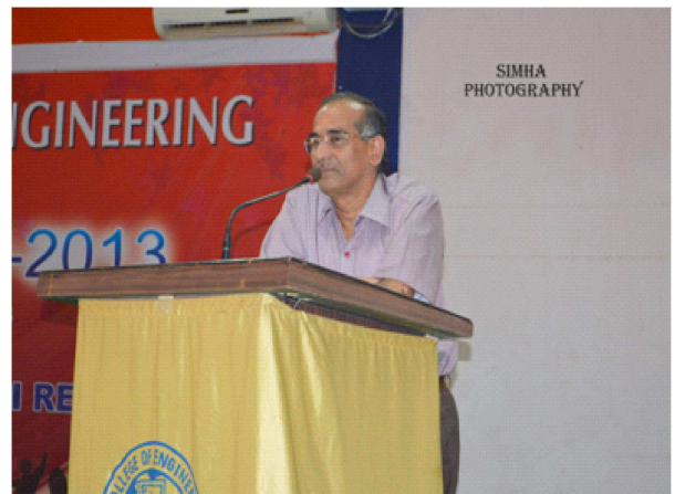
Chief Guest at the Annual Day