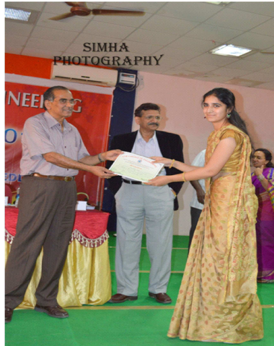
Academic Achievements Lauded