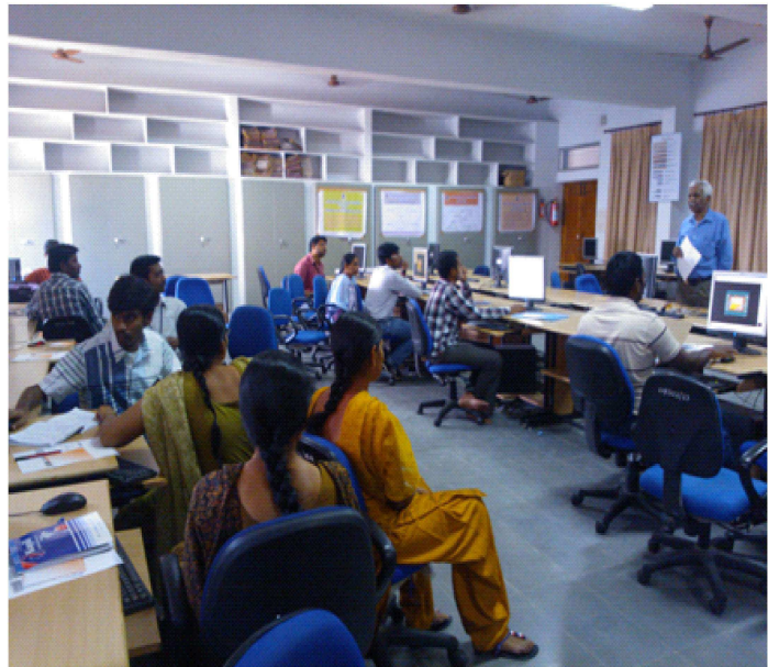
The Participants at the Workshop