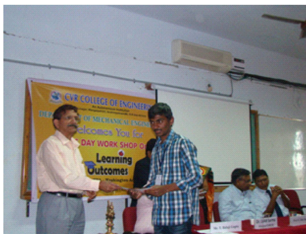
Participants Receiving Certificates