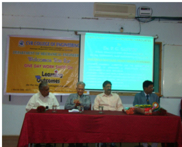
Guest Lecture in Progress