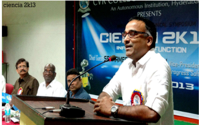
Chief Guest addressing the Gathering