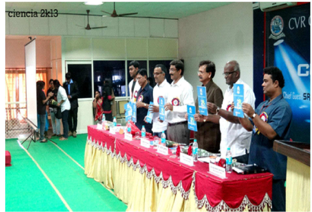
Release of CVR Journal at Techfest